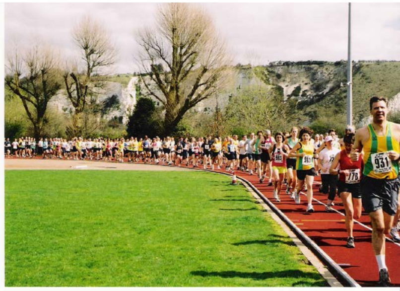
Lewes Athletic Club Fun Run