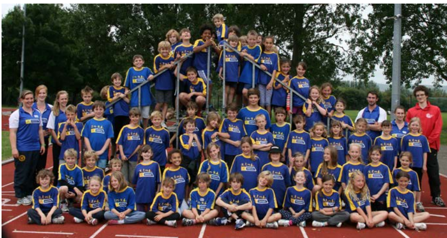
“Star Track” programme, Summer 2012