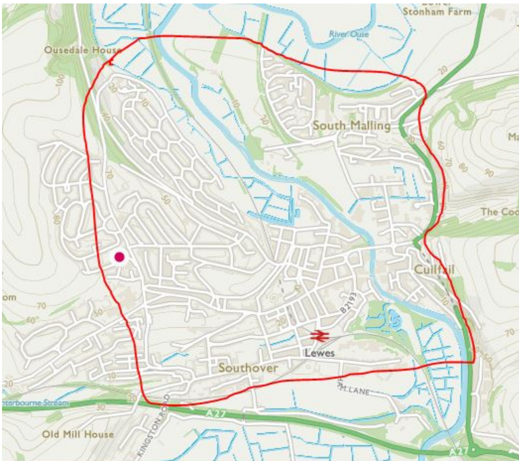
Map 1. The Red Zone of Lewes within which consideration of swift accommodation is required